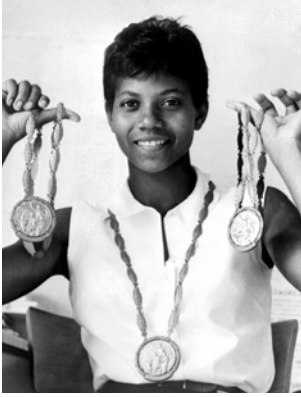
Wilma Rudolph, Summer Olympics, Rome 1960

Clarksville native and hometown hero Wilma Rudolph was famous in the 1960s as the fastest woman in the world. She was also the first American woman to win three gold medals in a single Olympics. Get a glimpse of her amazing story here: https://olympics.com/en/video/overcoming-obstacles-wilma-s-story (40 seconds)