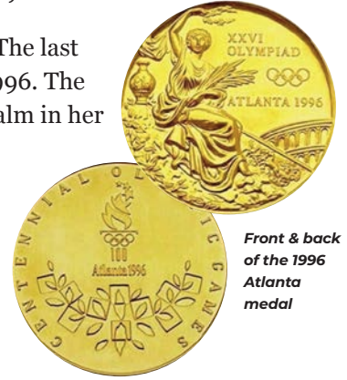
Front & back of the 1996 Atlanta medal

Each Olympic host city is responsible for designing its medals. The last summer Olympics held in the USA was in Atlanta, Georgia in 1996. The design included Nike, the Greek goddess of victory, holding a palm in her left hand and a winner's crown in her right; a "Quilt of Leaves" stylized olive branch design; the Olympic torch; the Olympic five rings symbol; the name of the city and the year.