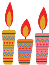
Candles to light their way.