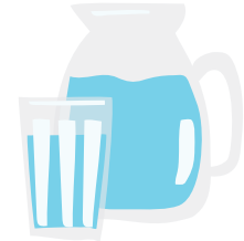
Water to quench their thirst after their long journey.