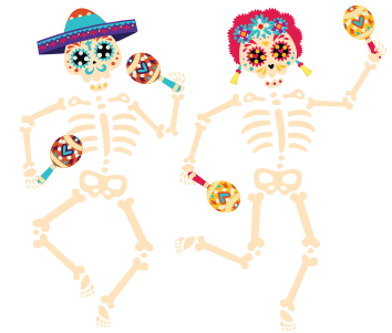
Skeletons, called calacas, shown doing silly things or having fun.