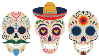
Dazzling sugar skulls.