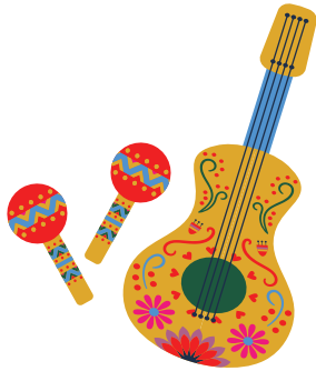
Favorite items from when they were alive, like a book or musical instrument.