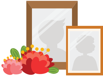
Photos of the departed loved one.

People in Mexico observe Día de los Muertos (Day of the Dead) on November 1st & 2nd. Tradition has it that the spirits of loved ones who have died come back to visit and party with family members. It is not a scary or spooky time at all – it is a happy and festive celebration that remembers and honors loved ones who have passed on. Families build colorful and decorative ofrendas (altars) to welcome the spirits home. These alters include different objects and symbols, such as: